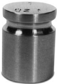
Leaf weights not pictured